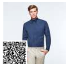
AIFOS L/S CM5504