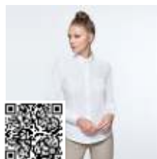
OXFORD WOMAN CM5068