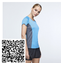
SHANGHAI WOMAN CA6648