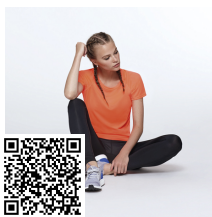
BAHRAIN WOMAN CA0408