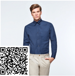
AIFOS L/S CM5504